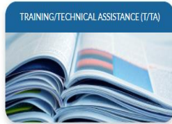
TRAINING/TECHNICAL ASSISTANCE (T/TA)